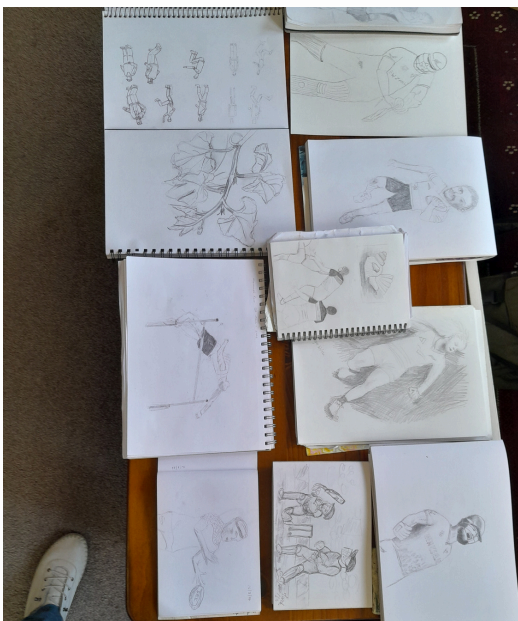
Some Sketching group members' work